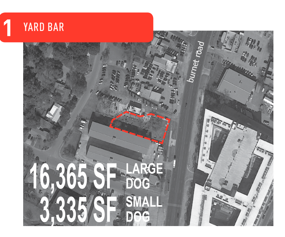
figure 1 | dog park comparisons

A comparison of three heavily used Austin dog parks was prepared and employed during the design of the Rollingwood Dog Park. This spatial analysis was used to ensure the proposed dog park will provide enough amenities for users and space for dogs to run and roam.