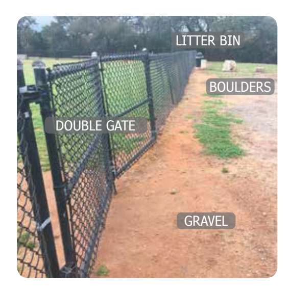
sports field edge