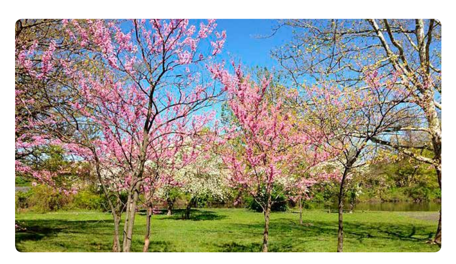
ornamental trees + seasonal interest