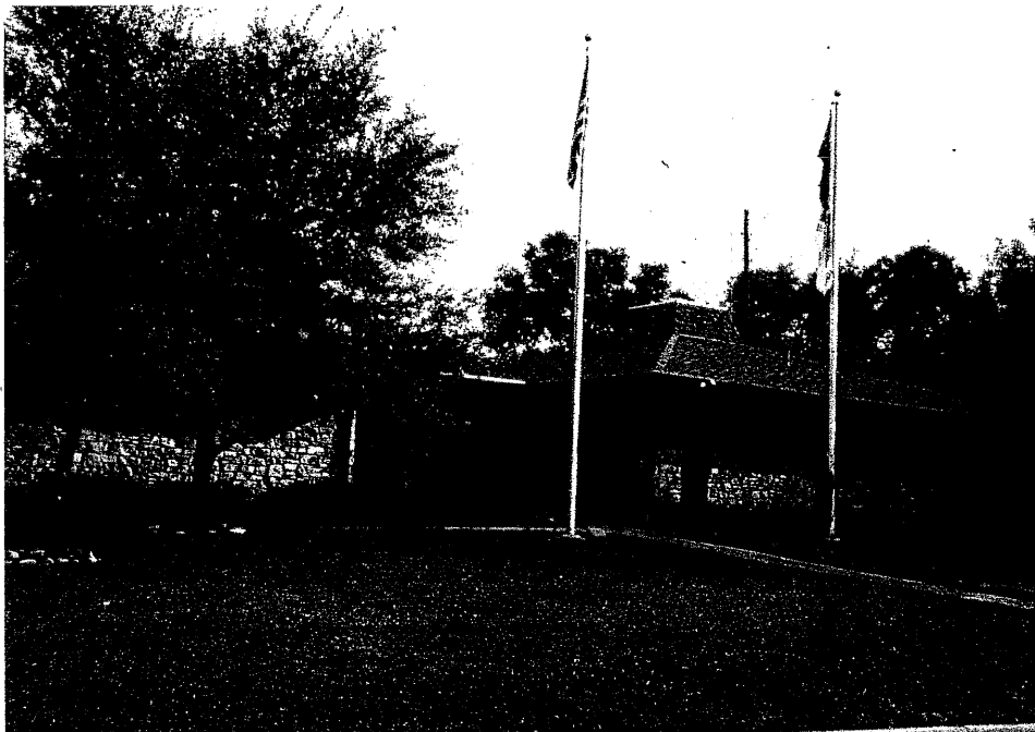
City of Rollingwood Municipal Building, 1986.